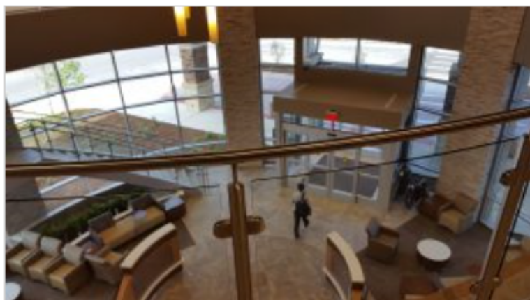
The lobby of UCHealth's new Broomfield hospital provides the visual focal point of the new 22-bed facility.

The facility's opening is being anticipated not only by UCHealth as the health-care system's only hospital along the booming U.S. 36 corridor, but also by Broomfield officials and developers of the Arista development, of which the new hospital is a part.