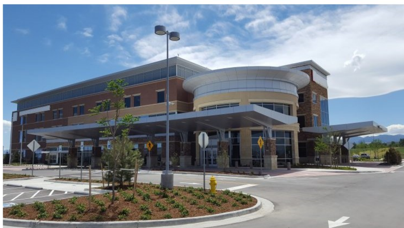
UCHealth Broomfield Hospital, 11820 Destination Drive, is slated to open by the end of this month pending state approvals.