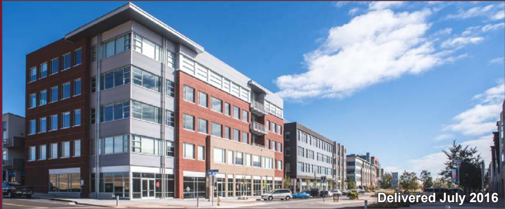
Delivered July 2016