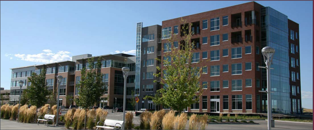
RETAIL SPACE BUILDING 8001